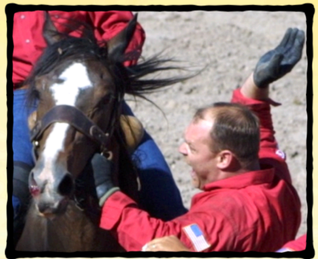
This is the true face of rodeo; ugly men beating and bloodying beautiful animals

SHARK is widely known as the experts on rodeos. That's why we were asked by groups in Canada and China to help them fight rodeos.