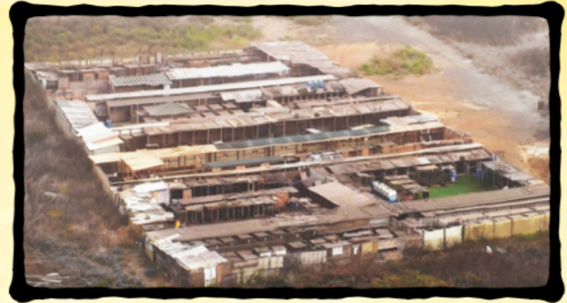
One of the CA cockfighting properties SHARK filmed

Working with our friends at The Humane Farming Association, In Defense of Animals, and United Poultry Concerns, SHARK has made astounding inroads in just a few months into the battle against cockfighting under our banner of "Crush Cockfighting!" Last year, we were asked for help by a California resident who found properties in Monterey County that violated a rooster keeping ordinance meant to shut down cockfighting operations. Our drones filmed these disgusting farms and our video was used by a Civil Grand Jury that issued a damning report about cockfighting in the county!