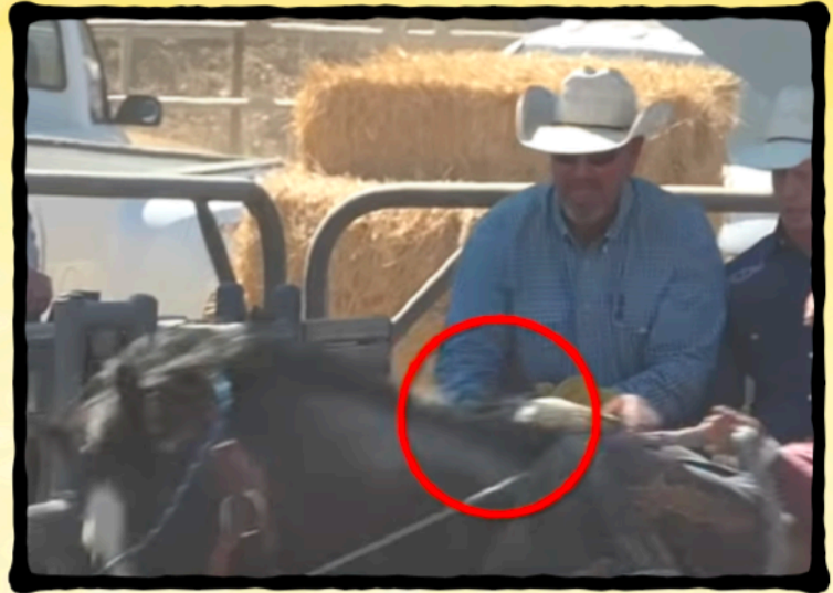
A horse being shocked at the Poway Rodeo

•This story received major news coverage that brought a great deal of attention to how horses are abused in rodeos. You can donate to SHARK's legal fund to help pay for cases like this.