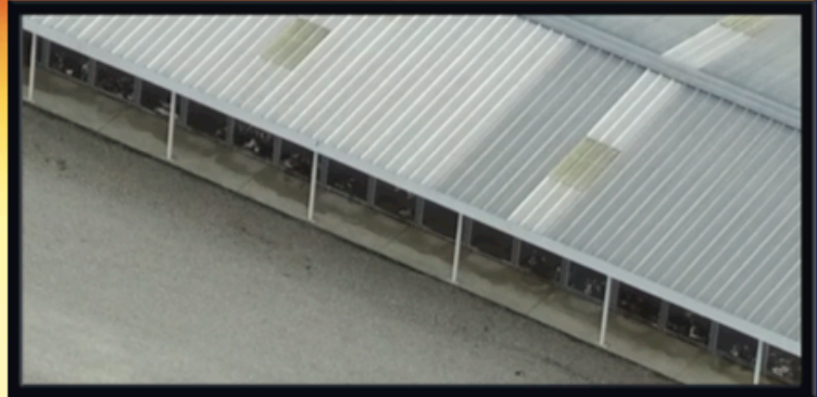
In the video from Covance beagle breeding, you can see dogs in their cages, whose barking was constant

The video, in which you can see dogs in their cages, endlessly crying out, has been seen more than 75,000 times and has brought attention back to the issue of dogs being bred so they can be experimented on and killed.