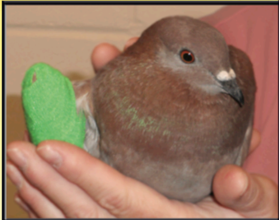
Hundreds of innocent pigeons were spared a horrific fate when this pigeon shoot was shut down

We cannot understate what a coup it was finding out about Schrader's. SHARK has investigated a Maryland connection to the underground pigeon shooting black market for years. All that was missing was the location where shoots were being held. With Schrader's now being exposed, we hope for a massive set-back for these vile shooters who take such pleasure in the destruction of innocent life.