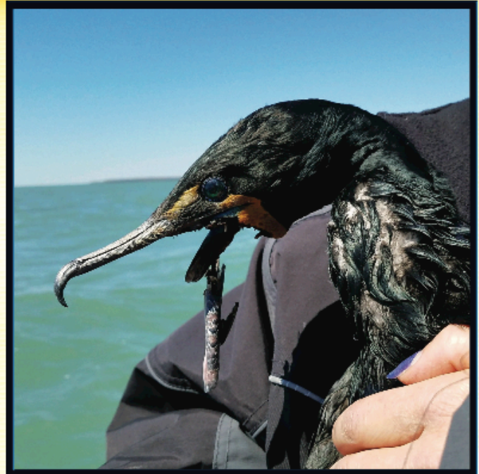
If not for SHARK, this poor bird would have died an unimaginably painful death

We were on the lake for an entire week fighting to save these majestic birds. In the end, our partners in Zoocheck and Cormorant Defenders International told us that because we were there, there were "far fewer" birds killed than in previous years. We take that as a great compliment, for everything we do is about saving lives.